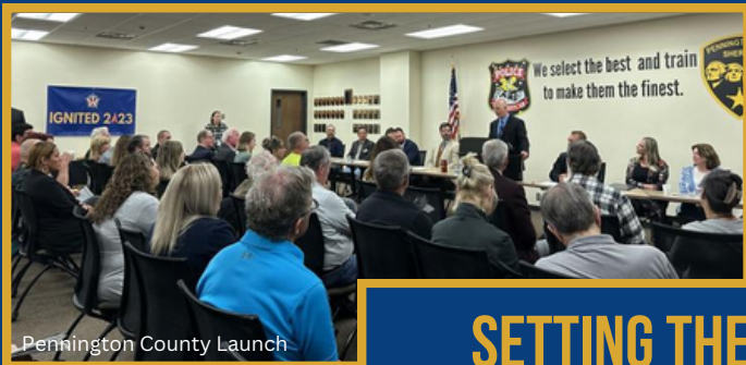
Pennington County Launch